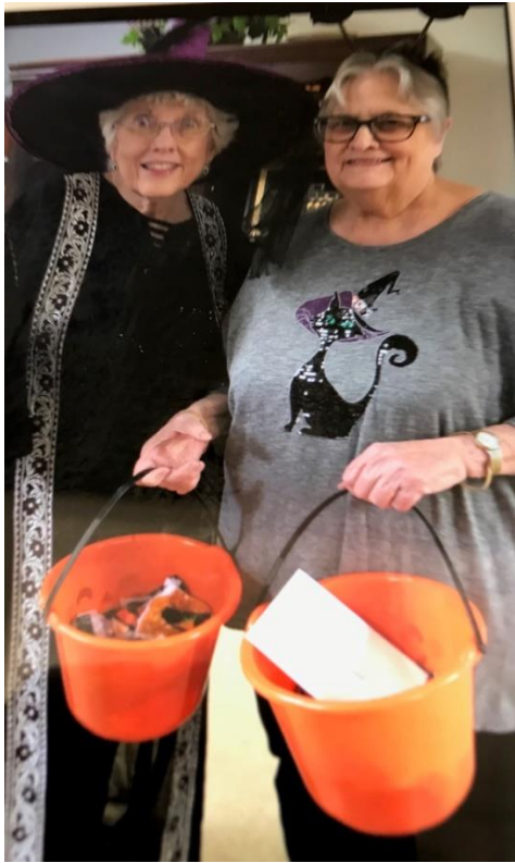
and Junior Past...Passed out some Halloween Goodies at the TMRC Clinic.